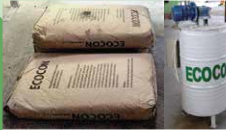
2 DELIVERY OF MATERIALS (ECOCON DRY MIX, MIXERS, TOOLS)