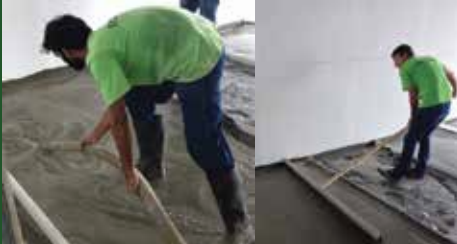
4 LAYING DOWN THE SCREED, INITIAL LEVELLING