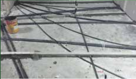
1 SURFACE PREPARATION, LATHS INSTALLATION