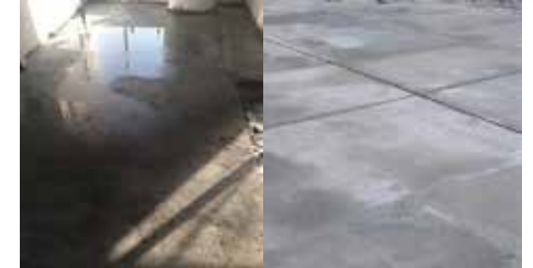
6 WATER CURING, EXPANSION JOINTS ARRANGEMENT