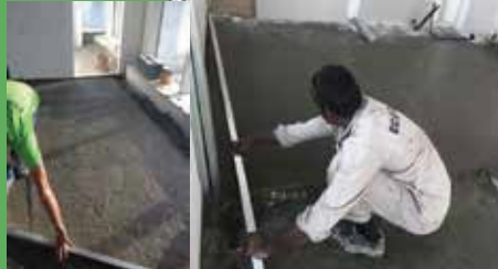
5 AERATION PROCESS, FINAL LEVELLING