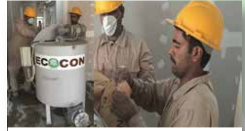
3 MIXING OF ECOCON DRY MIX